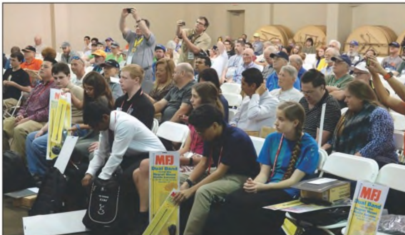
Photo A. The 2019 Hamvention Youth Forum – the 32 nd annual showcase of young hams – was well-attended as always.