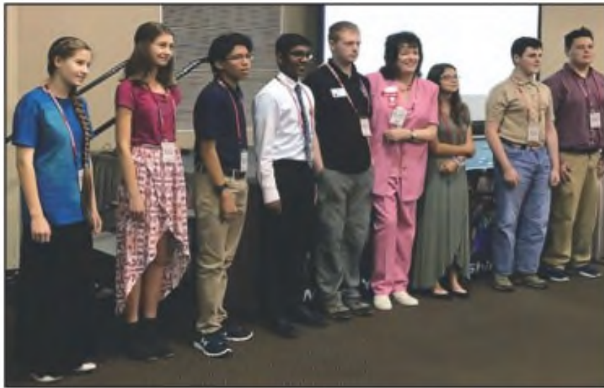
Photo I. At the end of their presentations, all of the speakers were called up to the front and given a standing ovation by members of the audience.

she and her family have had so many wonderful ham radio adventures in different countries.